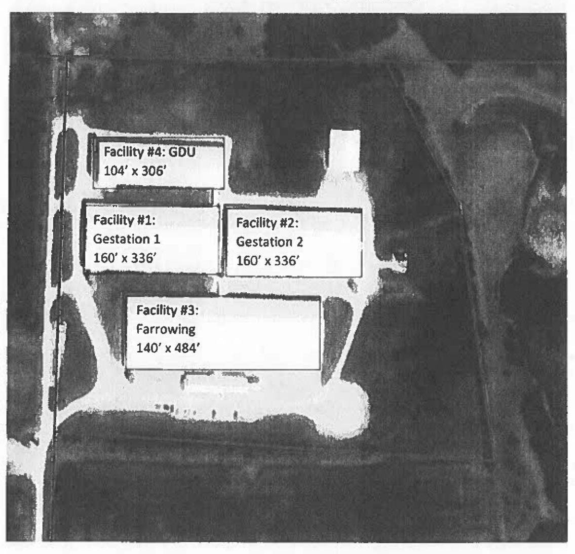
Falcon Ridge Farms, LLC Pollution Control Application